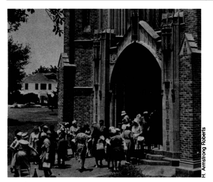
Sunday is observed by many because of the traditions established by men.

a few of the Jews who heard him believed God's truth. But among the Gentiles who heard him, there were many who believed.